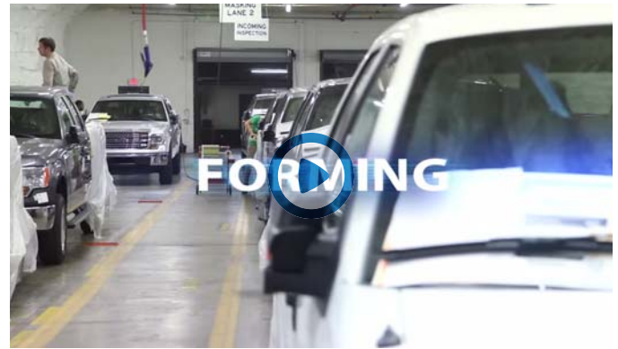
[VIDEO] "Automotive Alley - Where you need to be."