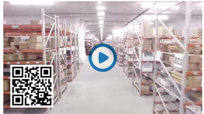
[VIDEO] Fly-through tour of a typical SubTropolis building.