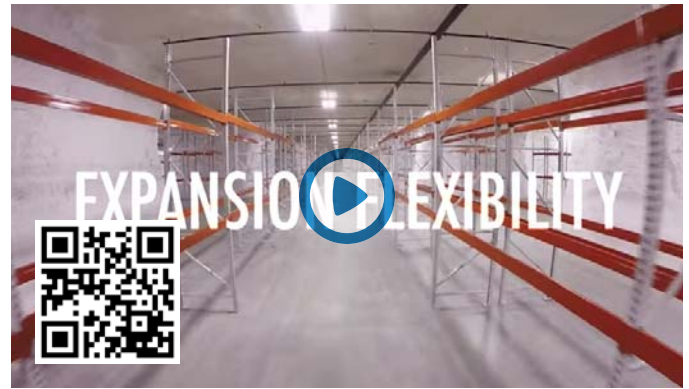
[VIDEO] "Location. Location. Location."